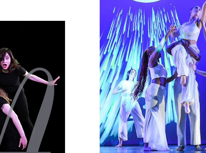
This show is in English

Desiderium is an interdisciplinary performance that integrates interactive technology. For centuries, stories have been used to explain the creation of lakes, mountains, and the Milky Way. Inspired by the tales from the Azores, Italy, Estonia, China, and Japan, the performance illustrates the path of thwarted lovers whose longing for one another left behind these glorious natural landmarks.